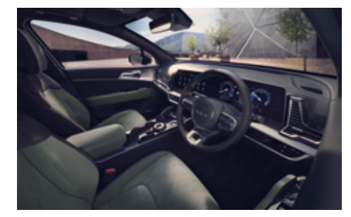
Anniversary Edition - Suede & Leather Seats