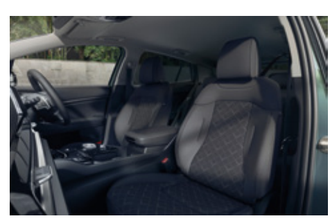
K2 - Black Premium Cloth Seat Upholstery