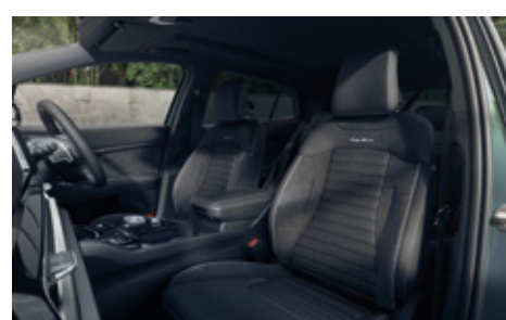
GT-line - Suede & Pressed Faux Leather Seat Upholstery