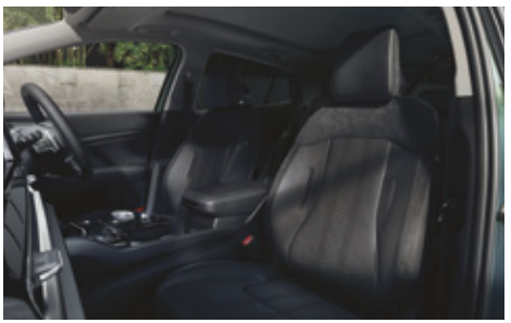
K3 - Black Artificial Leather Seats