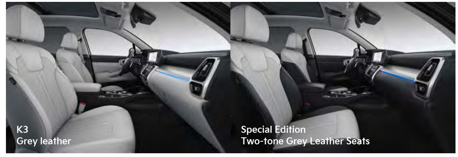
Note: Mood lighting strip not standard on K3 model