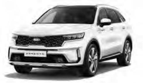
Snow Pearl White (SWP)