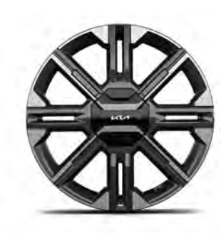
GT-line - 20" Alloy Wheels