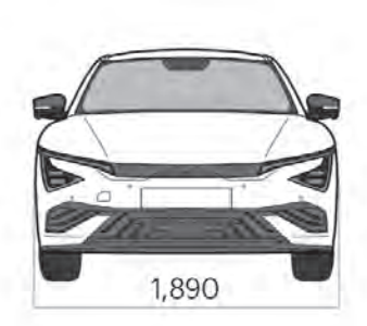
*Note - Final range and consumption figures pending homologation.