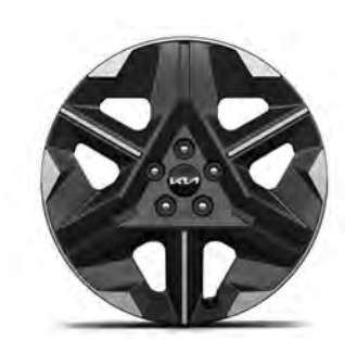
Earth - 19" Alloy Wheels