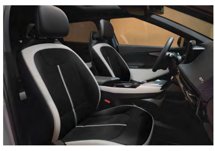
GT-line - Black Suede & White Vegan Leather