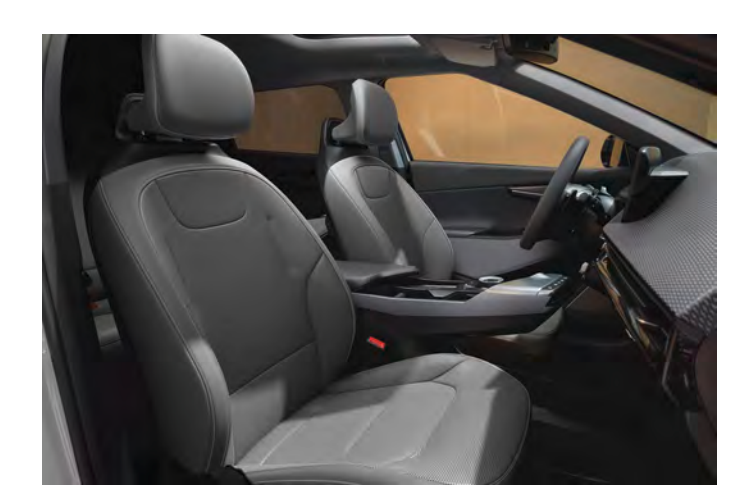
Earth - Medium Grey Vegan Leather